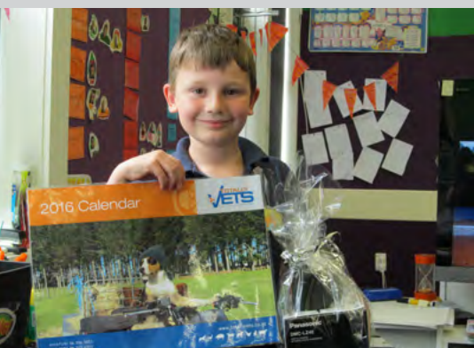
Photo Competition reminder